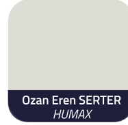
Ozan Eren SERTER HUMAX